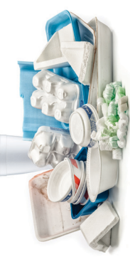
VASOS, PLATOS Y RECIPIENTES DE ESPUMA DE POLIESTIRENO