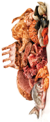
CARNE, PESCADO Y AVES