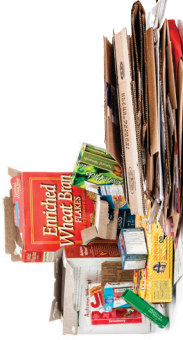
CARTULINA Y CARTÓN APLANADO