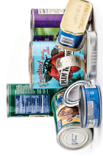
LATAS DE ALIMENTOS Y BEBIDAS