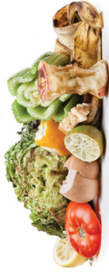
FOOD WASTE AND FOOD SOILED PAPER