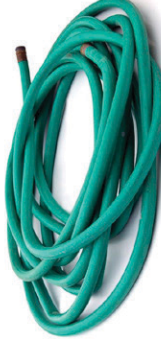
MANGUERAS DE JARDÍN