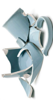
PLATOS Y OLLAS DE CERÁMICA ROTOS