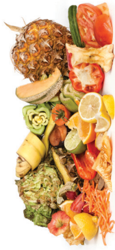
FRUTAS Y VERDURAS