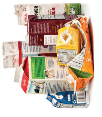
CARTONES DE ALIMENTOS Y BEBIDAS