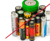
NO Batteries or Hazardous Waste