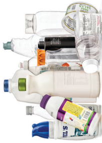
BOTELLAS, ENVASES Y RECIPIENTES DE PLÁSTICO