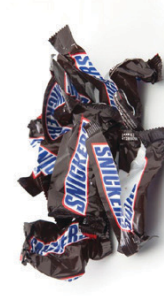
CANDY, SNACK & FOOD WRAPPERS