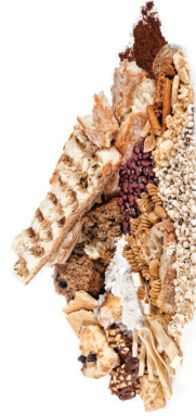
BREAD, PASTA, RICE, GRAINS, COFFEE GROUNDS AND FOOD SOILED PAPER