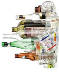
BOTELLAS Y ENVASES DE VIDRIO