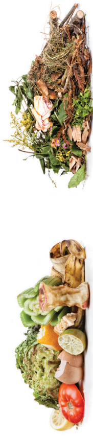
RESIDUOS DE ALIMENTOS Y PAPEL MANCHADO POR ALIMENTOS