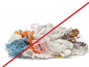
NO Plastic Bags & Film