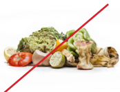
NO Food Waste