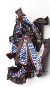
ENVOLTURAS DE DULCES, BOCADILLOS Y ALIMENTOS