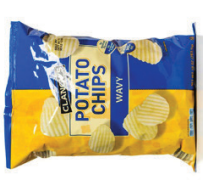
BOLSAS DE FRITURAS