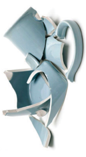
BROKEN CERAMIC DISHES & POTS