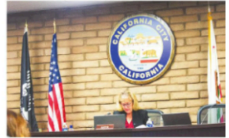
Former mayor Jeanie O' Laughlin