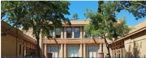
City of Martinez, CA