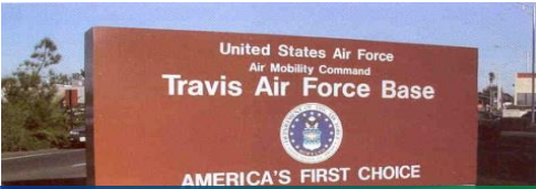
Travis Air Force Base