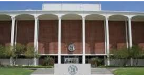
City of Fullerton, CA